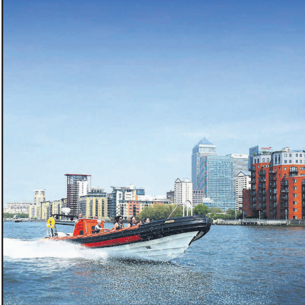
Taking to the river and waterways is a great way to see London. Above, an exciting high-speed trip on a rigid inflatable boat and, below, Camden Lock is at one end of the waterbus trip.

The Tube is one of London's best-known icons – but it's not the only way to get around the city. James Goffin explored the capital's waterways and found a number of ways to mess about on the river.